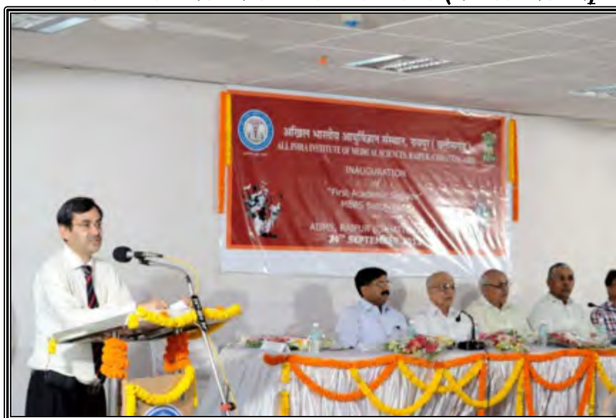
Director AIIMS, Raipur Addressing the “First Academic Session” MBBS-Batch 2012 of the Institute.