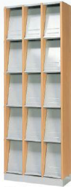
All dimensions are in mm. Accessories shown are not a part of our standard product offering.